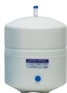
Tank 19 l

MIN WORKING PRESSURE 2 BAR MAX WORKING PRESSURE 8 BAR